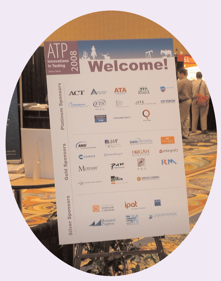
Loyal sponsors continued to make the the Innovations in Testing Conference a success in 2008.